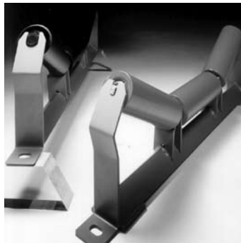
A3 L-30° Standard

On request transoms may be supplied with different dimensions, characteristics and angles.